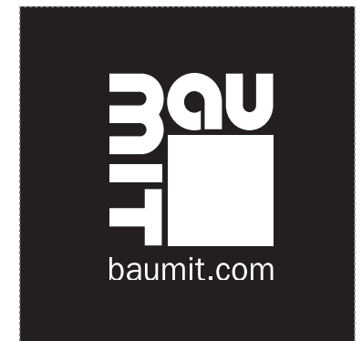
Single color use